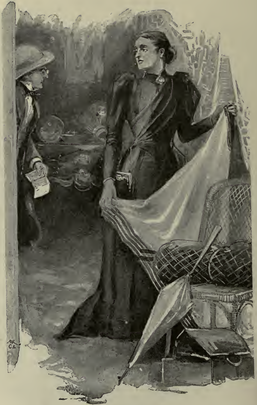
THE DOOR OPENED.